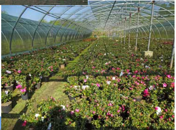
Evergreen Azaleas crop ticketed and ready to go out