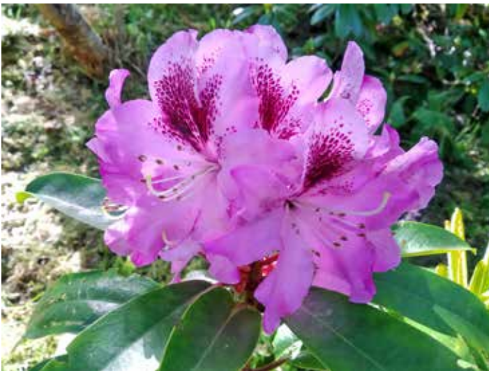
Rhododendron ‘Pfauenauge’ or ‘Peacock Butterfly’

P.S. This is written towards the end of an unusually (for recent years) cold February, and with snow on the ground with us nearly every day since Christmas Eve. The Beast from the East II hit us in the first half of February, snowing us in and one morning giving us our all time record low of -24°C. Braemar only got to -21.5°C according to the BBC. I generally selected my hybrids to be H5 or H6, so I’m hoping my babies are not too badly affected.