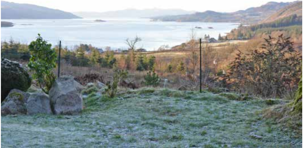
View down Loch Fyne. Can you see the Electric Fence?

intruding visually and would be at a considerably lower cost to post and netting. This it has proved to be!