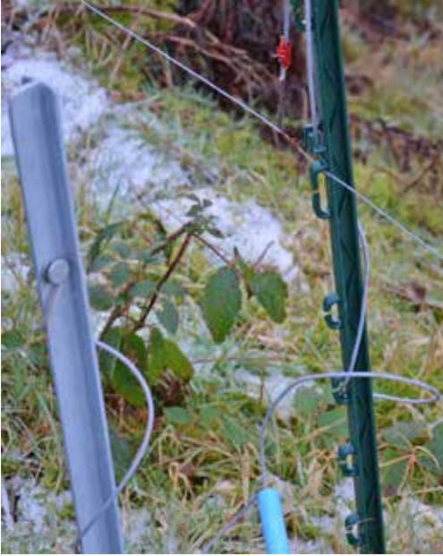
Connection to the line

We have now established 2 beds of new plantings of rhododendron and azaleas which are looking healthy and will surge ahead when the spring weather warms the south facing slope. We have planted dwarf and medium sized plants as we thought that a good range of different shapes and colours would provide a more pleasing effect rather than just a few large specimens.