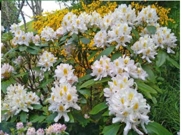
Rhododendron 'Madame Masson'