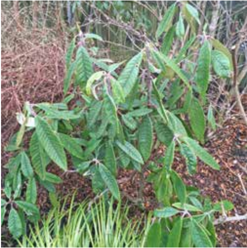
Above: Rhododendron denudatum