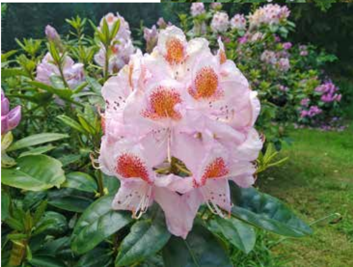
Rhododendron 'Mrs T H Lowinsky'